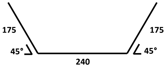
Generic gutter profile

Liner pinned and fixed before hot air welding of the stop end. Angle blank pinned and fixed after hot air welding of the stop end